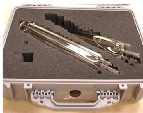
Figure 2. A pair of cells in a hard camera case. Note that the cells are placed along the vertical and horizontal diagonal to prevent water hammer effects.