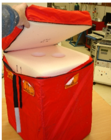
Figure 5. The sponge carry bag for shipping the cells. This bag has positions for two of the tubular cell carriers.