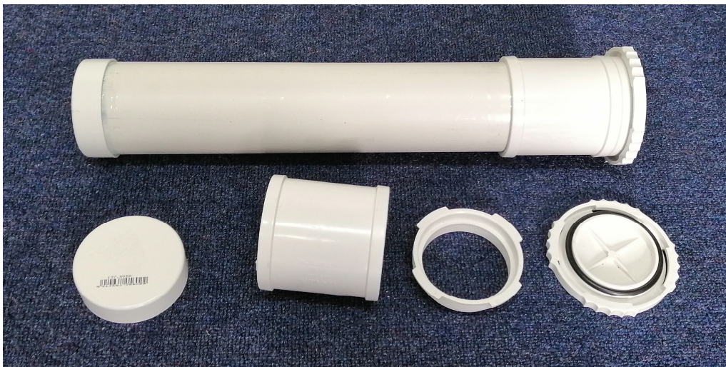
Figure 3. The assembled cell carrier and some of its component parts, including the endcap, the joiner section, and the inspection cap and mounting ring. Note the O-ring and the 1/8 th -turn locking mechanism of the inspection cap.

Finally, the cell carrier is shipped in a large cube of sponge in a closed cloth carry bag, as shown in Figure 5.